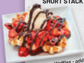
Large Waffles - add Strawberries & Nutella

SHORT STACK / 2 Pancakes - 11 (v/gfa/vga) | REGULAR STACK / 3 Pancakes - 13 (v/gfa/vga) | TALL STACK / 4 Pancakes - 15 (v/gfa/vga)